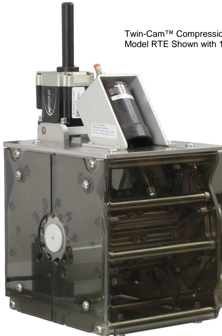
Twin-Cam™ Compression Station Model RTE Shown with 124mm Length

Model RTE has a rotor-nut stepper motor with an integrated encoder for precise control of the compression diameter. The motor has a built-in drive and motion controller. The actuator force is measured by a transducer with high-level output. The compression head ships with cabling providing RS-485 connectivity to the motor. Mating panel mount connectors are provided for all electrical connections.