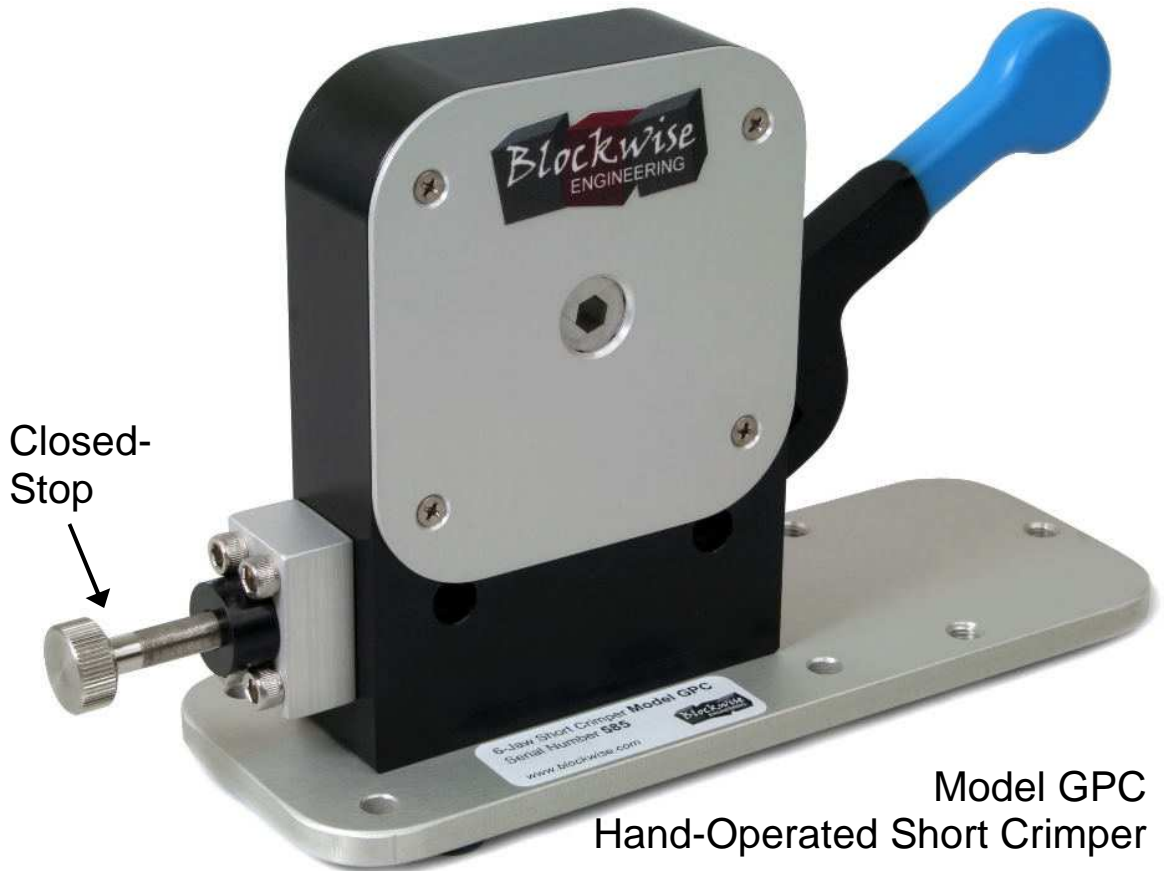
Model GPC Hand-Operated Short Crimper

The model GPC is a hand-actuated crimper with a handle and a mechanical closed-stop. The closed-stop screw may be used to set the crimp diameter. To set the diameter, typically the operator inserts a gage pin of the desired size, then adjusts the stop screw until the jaws touch the pin.